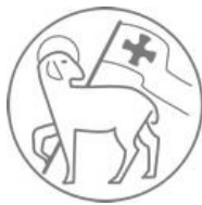
Our Lamb Has Conquered

32 Adult and 2 Youth commitment/stewardship cards have been filled out and returned to the church by our congregation