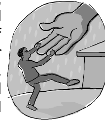
Lending a Helping Hand

"Give all who suffer the love that bears all things, believes all things, hopes all things, endures all things"